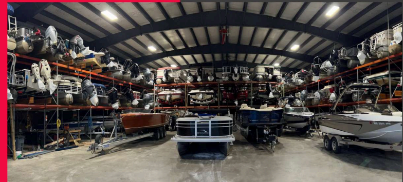
Lakeside Boat Storage