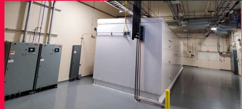
CSL Data Center