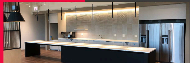
One O'Hare, 12th Floor, Reyes-Fernwood