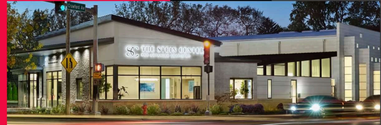
Stein Center for Advanced Dentistry