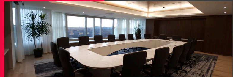
One O'Hare, 9th Floor, Reyes Group