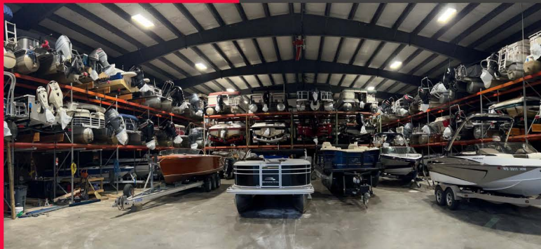
Lakeside Boat Storage, 2022