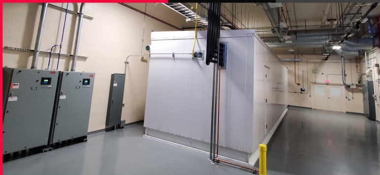
CSL Data Center, 2021

PARTNER: K2N Crest SERVICE PROVIDED: MEP.FP AREA: 90, 000 SF YEAR: 2022