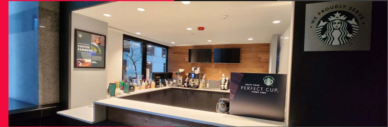
Starbucks, One O'Hare, 2022