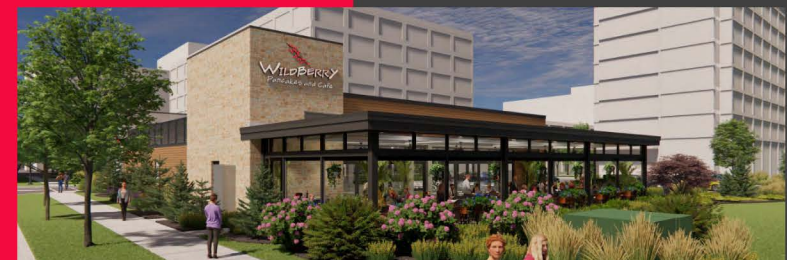
Wildberry Restaurant, (Under Construction, 2025)