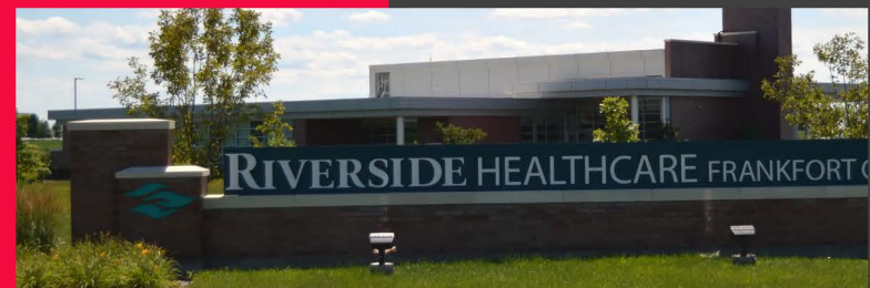
Riverside Healthcare Frankfort Outpatient Center, 2016