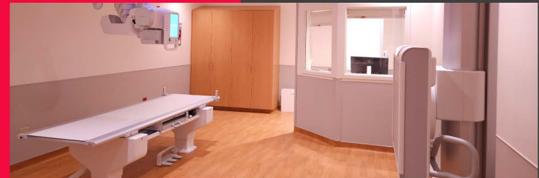
Loyola Medicine Imaging Center, 2025