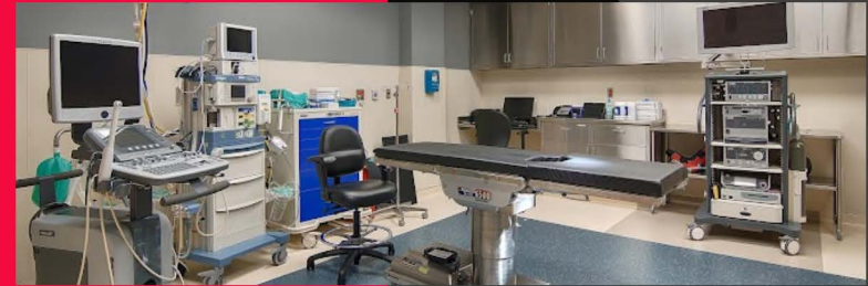
Naperville Family Center, 2014